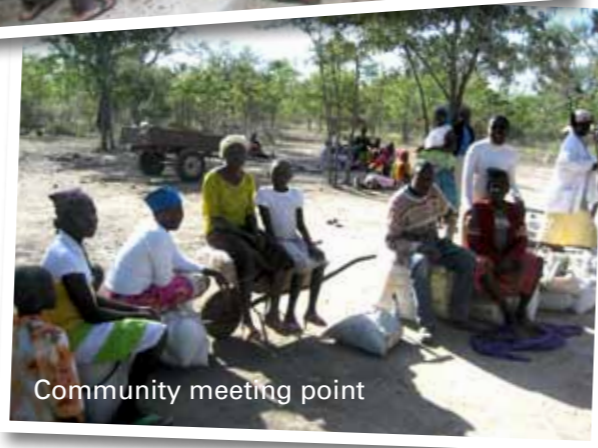
Community meeting point