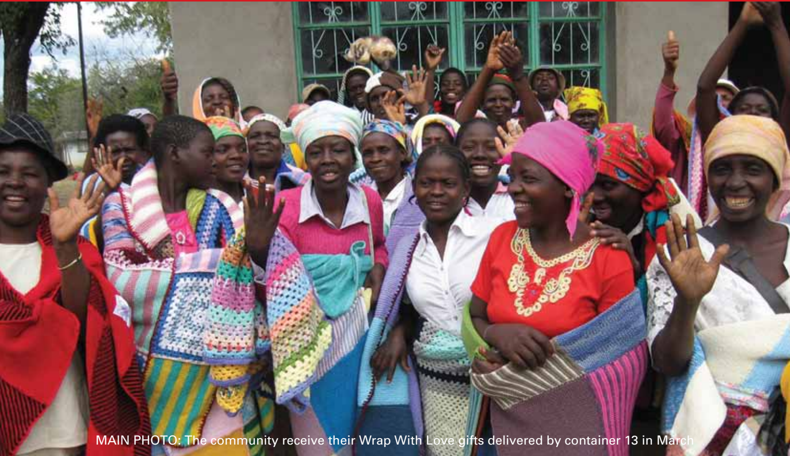
MAIN PHOTO: The community receive their Wrap With Love gifts delivered by container 13 in March

NEWSLETTER OF AID FOR AFRICA DOWN UNDER (AFADU)