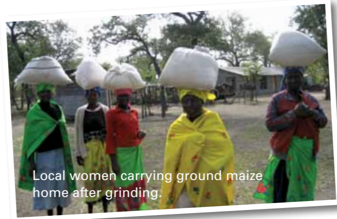
Local women carrying ground maize home after grinding.

By January 2011 all the necessary permits had been obtained and the mill, a Drosky S6 and 20HP Lister engine had been purchased and transported to Edenvale Farm. The bricks to erect the building that will house the equipment had been made and the