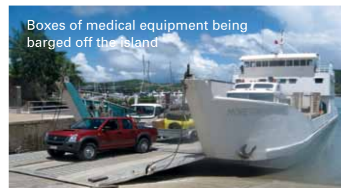
Boxes of medical equipment being barged off the island

In December 2010 the entire island got behind a Fundraiser AFADU held at the HAMILTON ISLAND YACHT CLUB that raised over $18,500 to go towards accommodation dormitories for trainee nurses who will attend the Nursing School that has already been built with AFADU funds. This night was a fantastic opportunity to enjoy African food, African drumming, the African film Tsotsi and for our community to dig deep at the fun-filled auction made possible