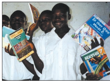
TWO FOR ME? Sorting out books.

Please provide address, telephone, and contact details so that a receipt can be provided for this tax-deductable donation.